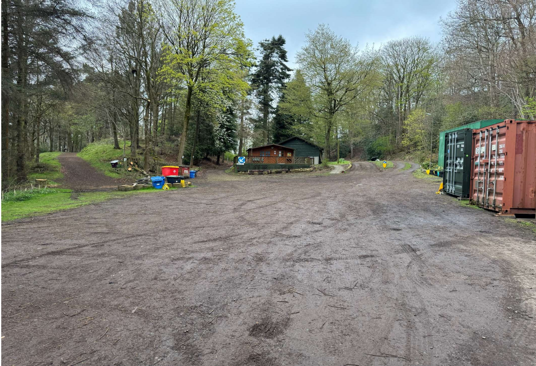
Car Park in normal day to day use 1 of 2